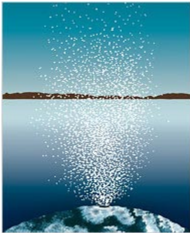
Illustration by Ivan Chermayeff