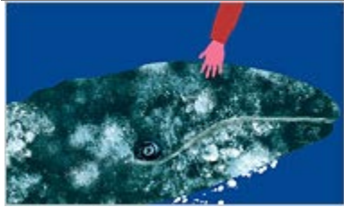
Illustration by Ivan Chermayeff