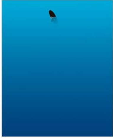
Illustration by Ivan Chermayeff